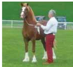
Brynmelys The Real McCoy

Sec A, C & D stock for sale Visitors always welcome